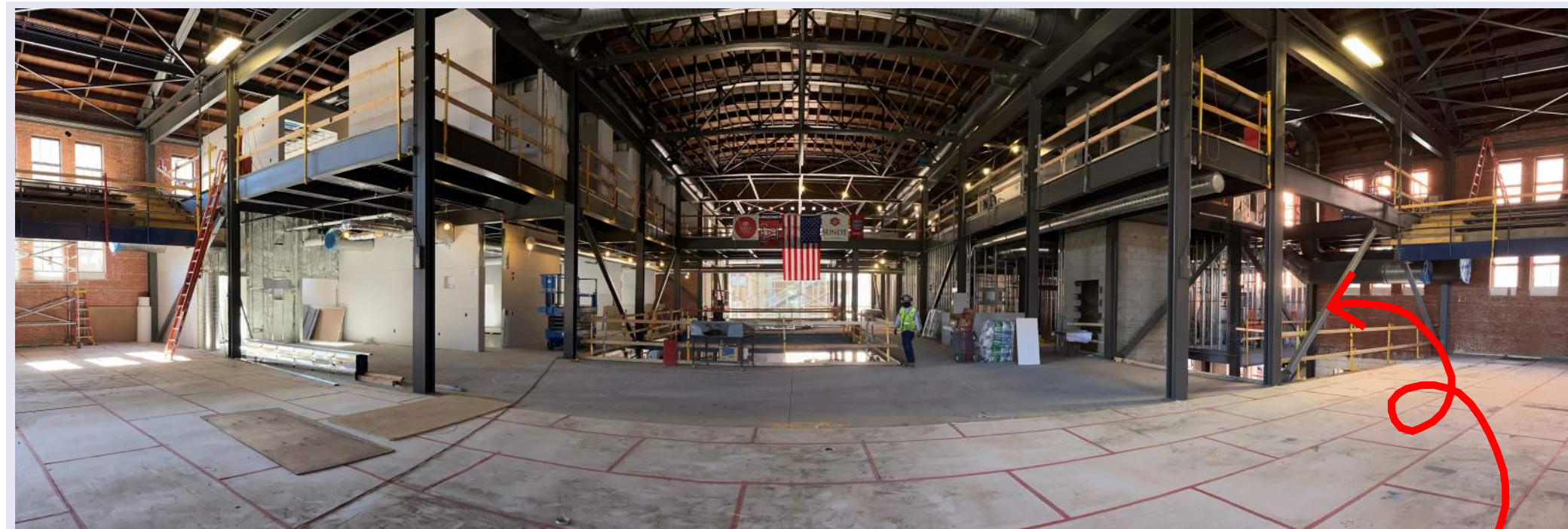
Inside the main entrance standing on the historic gym floor, looking south. Level 2 drywall is going in on top of insulation and in-wall mechanical, electrical, and plumbing systems.

Construction Update - Week of May 24, 2021