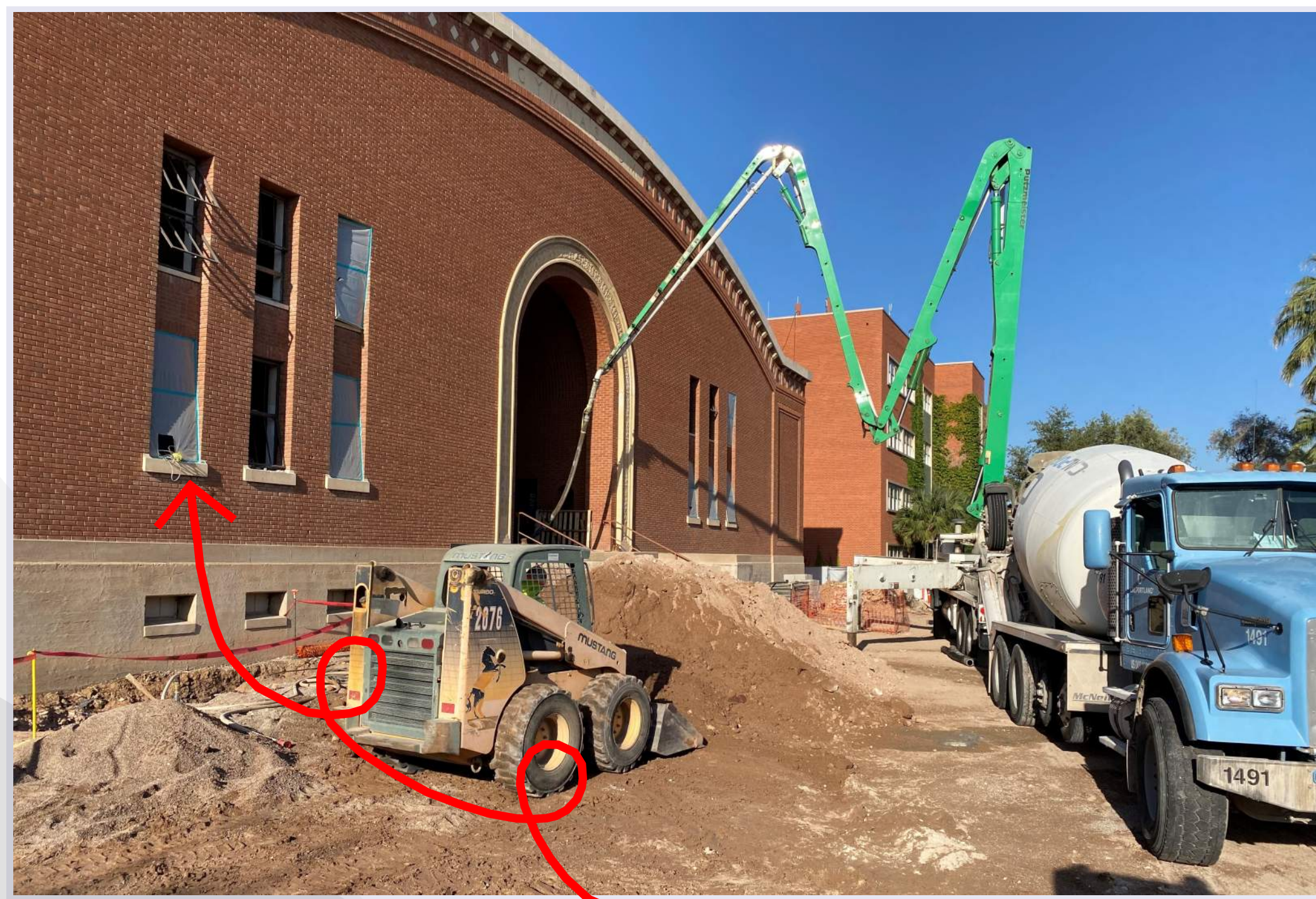
View of the Main Entrance on the north side of the building during one of the last major concrete placements. The concrete slab that was placed here will be the floor of a new catering kitchen tucked into the northeast corner of the building.